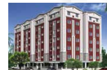
SLV TOWERS I