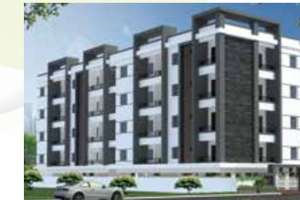
SLV SYAM ENCLAVE