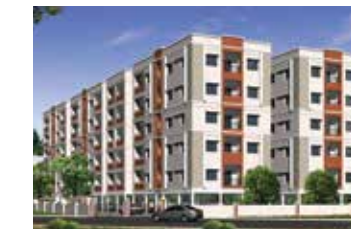
SLV MYTHRI TOWERS