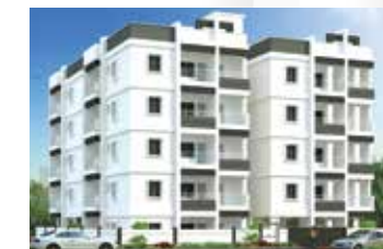
SLV GOKUL HOMES