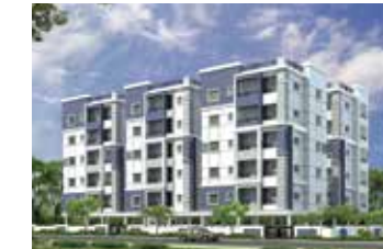
SLV GANGOTRI TOWERS