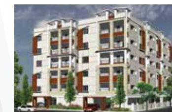
SLV TOWERS II