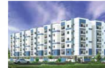
SLV YAMUNOTRI TOWERS