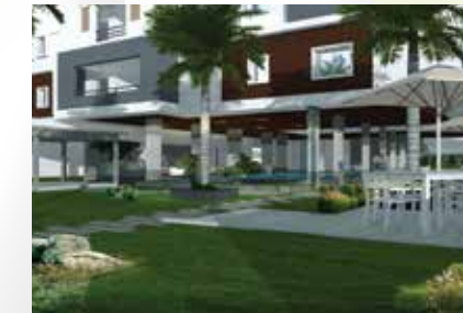
SLV ARCADE PARTY LAWN - BHIMAVARAM