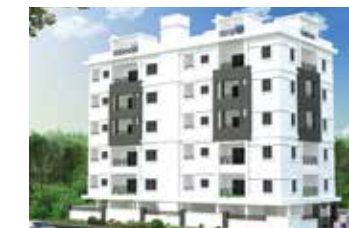
SLV ASR TOWERS