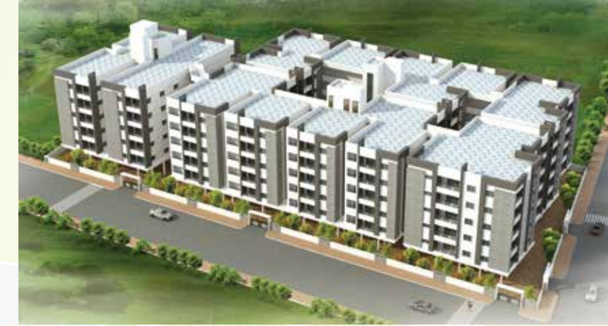
SLV 99 GBS TOWERS - BHIMAVARAM