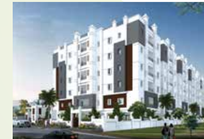
SLV ARCADE - BHIMAVARAM