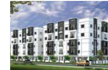
SRI RAGAVENDRA TOWERS